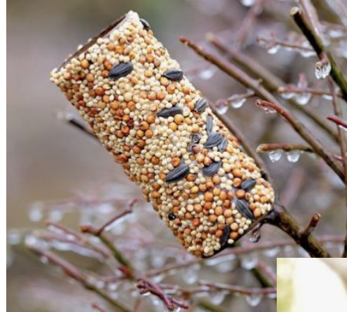
Toilet Paper Roll